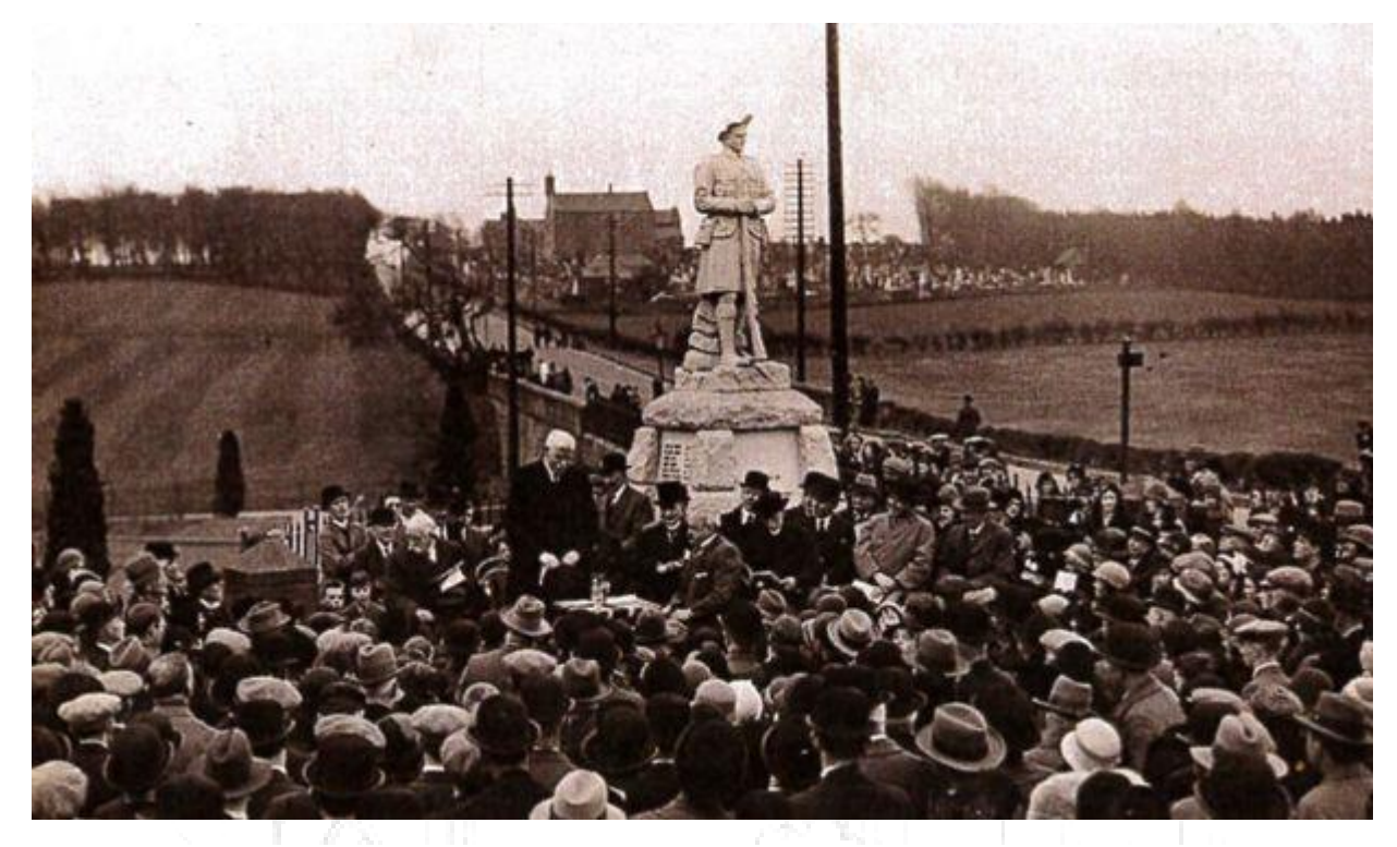
Holytown war memorial on the date it was unveiled

"These memorials serve as a focal point for communities and now more than ever that can be much needed."